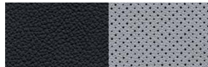
Leather - Shale Gray 皮革 - 淺灰雙色