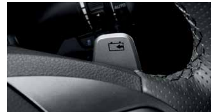
Paddle shifters (regenerative brake control) 軌盤撥片(電力回收程度操作)