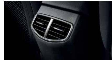
Rear air ventilation 後排冷氣出口