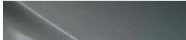
Typhoon Silver (T2X)