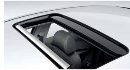
Power sunroof with anti-pinch feature 電動天窗連防夾功能