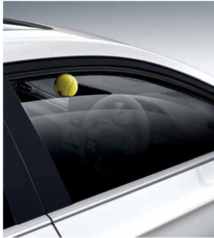
Safety power window controls 前安全電動門窗