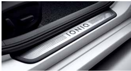
Chrome IONIQ-badged door scuffs 電鍍門邊腳踏