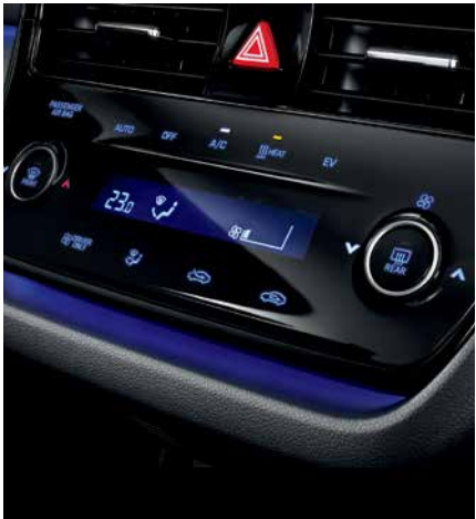
Touch control climate system 輕觸式冷氣調控