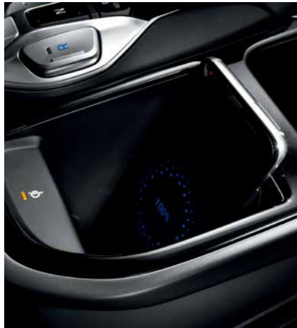
Smartphone charging system 手機無線充電