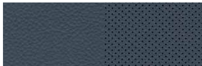
Leather - Electric Shadow 皮革 - 灰藍