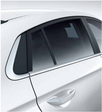
Chrome beltline molding 電鍍腰線裝飾