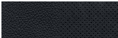
Leather - Dark Gray 皮革 - 深灰