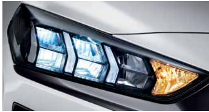
LED headlamps LED 頭燈