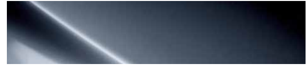
Electric Shadow (USS)