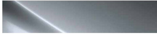
Fluidic Metal (M6T)