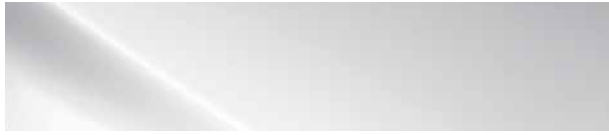
Polar White (WAW)