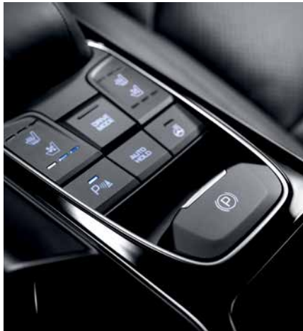
Electronic parking brake 電子泊車手制