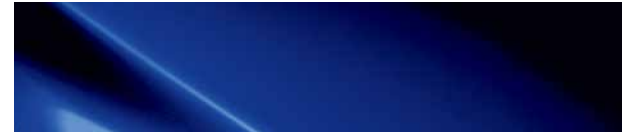
Intense Blue (YP5)