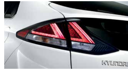
LED rear combination lamps LED 尾組合燈