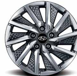
16" alloy wheels 16 吋合金輪圈