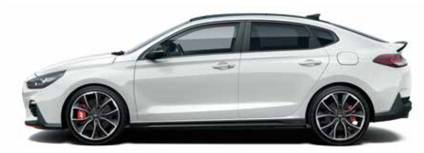
Polar White (Solid)