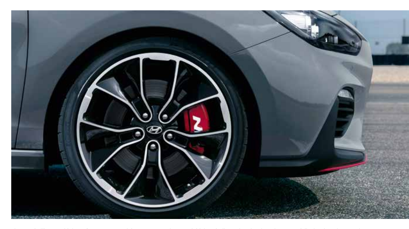
The 19" Pirelli P-Zero high-performance Hyundai N tyres sport the "HN" initials to indicate that they have been specially developed to match the chassis characteristics of the N range.

The i30 Fastback N is as hungry for corners as you are – equipped with an impressive array of high-performance components that provide world-class cornering ability. Like the direct and highly precise rack-mounted motor-driven power steering. Or the N Corner Carving Differential, which has been specifically designed and engineered by Hyundai to provide a unique carving feel through even the most challenging bends. It enhances your grip, delivering maximum power to the road while increasing driving fun and maximum speed cornering in the curves.