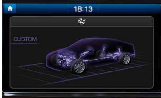
Heading to work or driving on your favourite curvy back road? Depending on your mood and the road conditions, you can choose between 5 drive modes: Eco, Normal, Sport, N and N Custom.