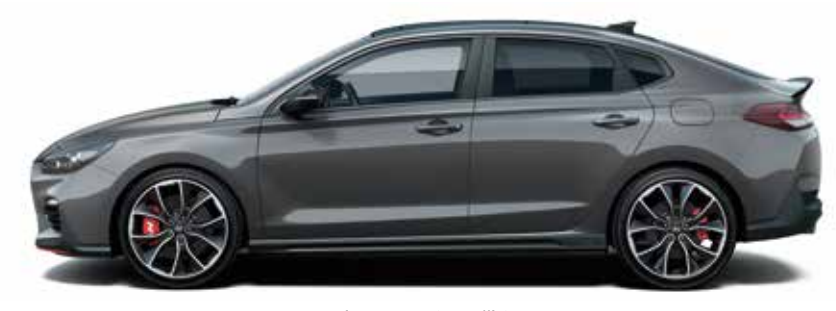
Micron Grey (Metallic)