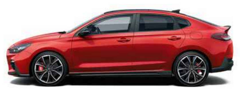
Engine Red (Solid)