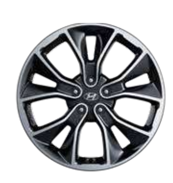
19" alloy wheel