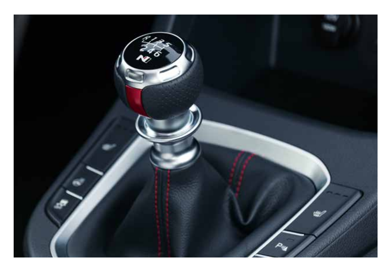
Perfect for enthusiast drivers who love to operate a crisp shifter and a tight clutch, the ball-type gearshift also features a red stripe and the N-badge.

Welcome to a whole new level of sportiness. Sit down in the i30 Fastback N's racing inspired cockpit and you'll feel its motor sport roots instantly. The uniquely designed high-performance N sport seats keep you in control and comfortable, with power lumbar support and extendable seat cushions. They feature the N logo and red contrast stitching and are available in a suede and leather combination or full cloth. The sporty character of the interior is further strengthened by the high-quality materials, red air vent rings and dark metal inserts that can be found throughout.