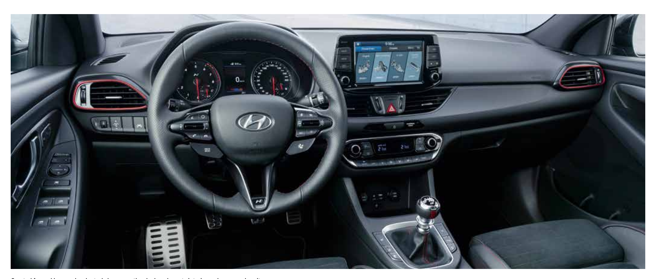
Created for and by people who truly love cars, the sleek and sporty interior embraces and excites.

The i30 Fastback N cockpit is as much about control as it is about comfort. The ergonomics are completely driver-focused – you have everything in view and at your fingertips. And to help you monitor your driving performance, the High Performance Driving Data function allows you to display track data on the optimally positioned floating touch screen. Featured driving data includes: HP, torque, turbo boost and G-force as well as a lap and acceleration timer.