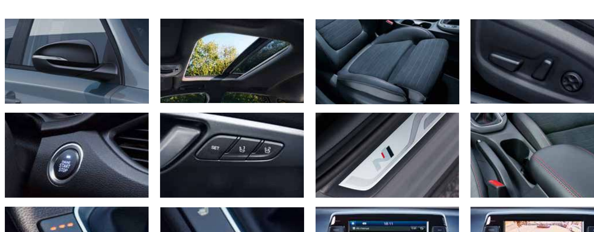
Electric folding mirrors in glossy black Smart key & Button start Heated front seats