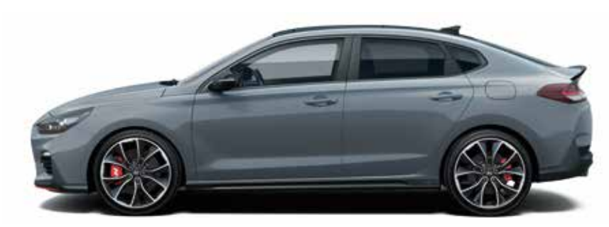
Shadow Grey (Special)