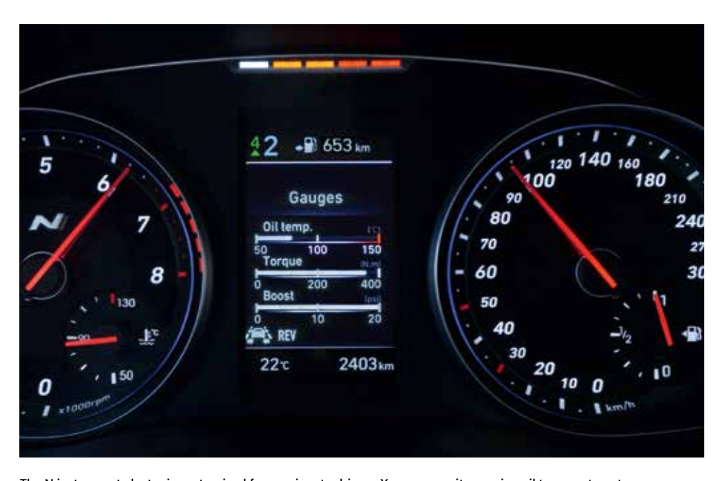
The N instrument cluster is customised for passionate drivers. You can monitor engine oil temperature, torque, and turbo boost at a glance. It features a shift timing to support track driving. The red zone of the variable LED rev-counter changes according to engine temperature.

The i30 Fastback N comes equipped to perform at a track day with a wide range of racetrack features for enhanced performance. Tested in extreme temperatures and extreme locations, there's no need to upgrade anything. On the track, you're supported by technologies that boost the fun factor. Launch Control helps to launch the car from standstill as easy as possible by controlling the engine torque. The Rev Matching feature automatically increases the revs on the engine when shifting so you can enjoy smoother and faster downshifts. The Overboost improves acceleration performance for a short time – perfect for getting past a difficult competitor.