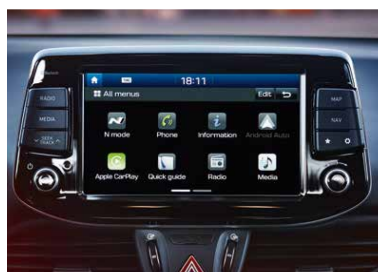
8" touch screen display