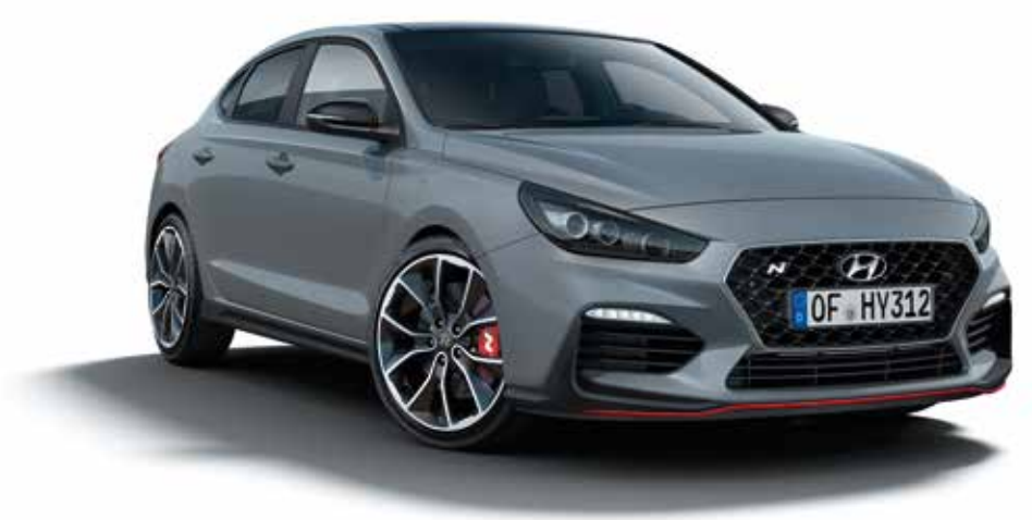
i30 Fastback N Performance Package (275 HP)