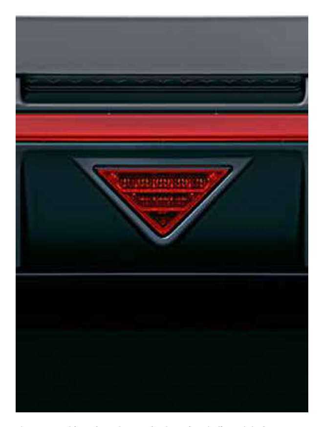
The eye-catching triangular LED fog lamp is a dedicated design element of Hyundai's high-performance N range.

In the rear, the sophisticated lines of the sloping fastback roofline flow gracefully into the generously arched rear spoiler with its distinctive glossy black accent. Inspired by a drop of water, the C-pillar treatment and rear windscreen are designed with soft, elegant shapes that reinforce the car's tapered belt line. The sculpted rear bumper also features a reflective character line that arches above the chromed double muffler exhaust system for a sporty, muscular look.