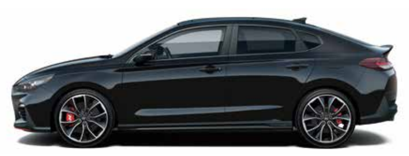
Phantom Black (Pearl)