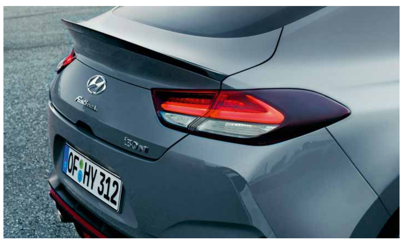
The rear spoiler and LED combination lamps harmonise perfectly with the sculpted side character line, highlighting the distinctive look in the rear.