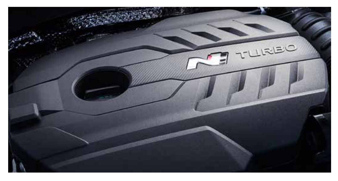
The 2.0 Direct Injection Turbo engine delivers a choice of 250 HP in the Standard Package, or 275 HP in the Performance Package. Both variants generate a maximum torque of 353 Nm.

The blistering performance of the i30 Fastback N is driven by a highly responsive 2.0 L direct injection turbo engine providing up to 275 HP. Featuring an overboost function that temporarily increases torque to 378 Nm, the i30 Fastback N is equipped with front-wheel drive and a six-speed manual transmission with a carbon synchronizer ring and a strong clutch. The power of the engine is transferred directly to the gear train in order to always be ready for shifting without any torque interruption. Short shift travel helps with fast shifting and gives you sporty response for more racecar feeling in everyday life.