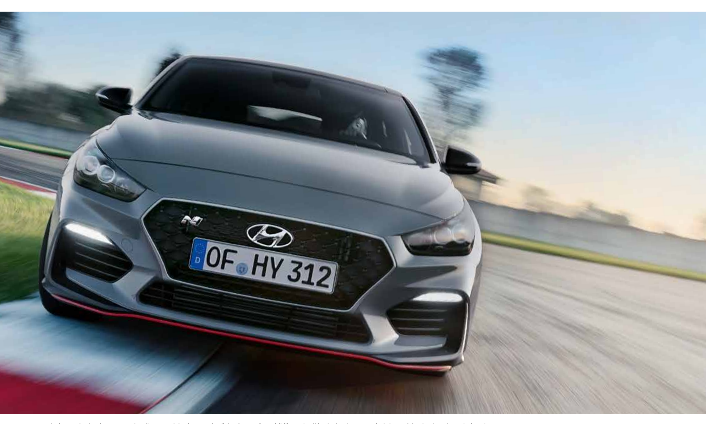
The i30 Fastback N features LED headlamps and daytime running lights for excellent visibility and striking looks. The aggressively large air intakes have been designed to enhance brake cooling and aerodynamics.