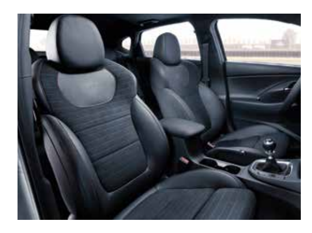
Full cloth (Standard) Suede-leather combination (Optional)