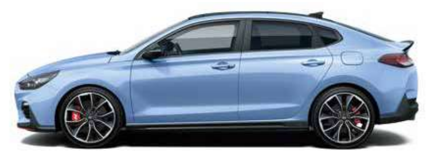
Performance Blue (Special)