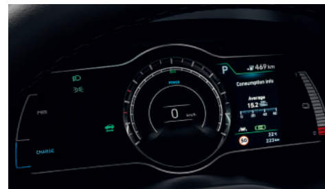
7" digital cluster 7吋電子屏幕儀表板

車輛各個系統,以及換檔的操控也在你的指控之間。中央的7吋電子儀表板,為您清晰地提供行車資訊,附設在軼盤上的能量回收撥片,令您更得心應手地操控著KONA Electric。