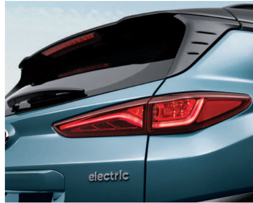
LED rear lamps LED 尾燈