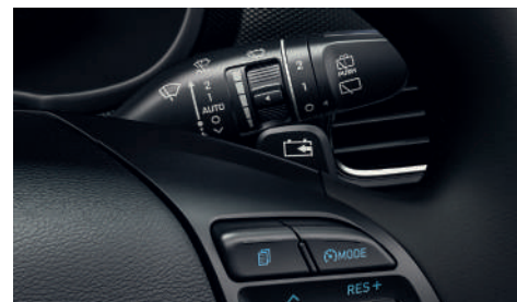
Paddle shifter (Regenerative braking control) 軼盤撥片(能量回收制動控制)