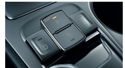
Electronic gear shift button 電子轉波按鍵