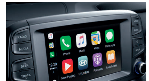
7" touch screen infotainment system 7吋輕觸式資訊娛樂系統