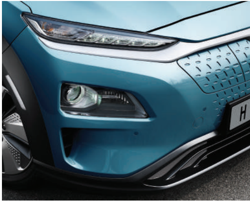
Grille and twin headlight design 型格雙頭燈及格柵設計

全新KONA揉合立體曲線及獨特頭尾設計,無論從任何角度,同樣展現時尚型格。車頂及倒後鏡更可讓您選擇切合您個人風格的顏色。KONA就是敢於與眾不同。