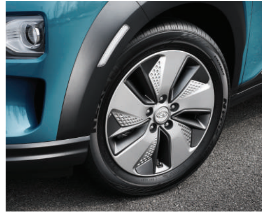
17" alloy wheel 17寸合金輪圈