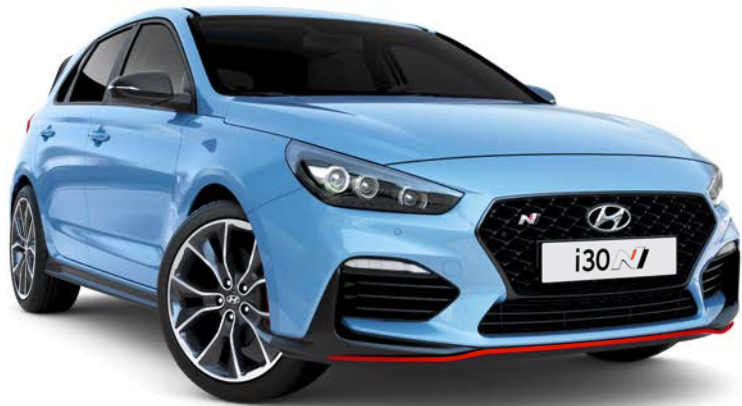
i30 N Performance Package (275 PS)