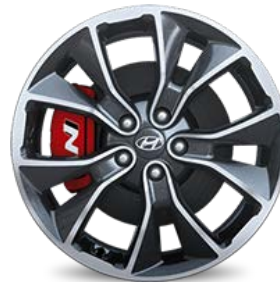
19" alloy wheel 19吋合金輪圈