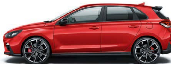
Engine Red (Solid)