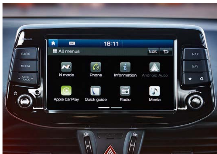
8" touch screen infotainment system 8 吋輕觸式資訊娛樂系統