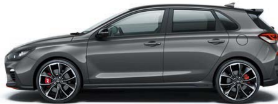
Micron Grey (Metallic)