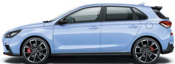
Performance Blue (Special)