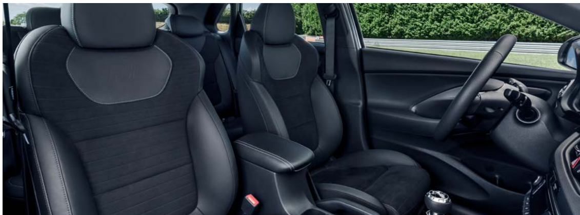
Suede-leather combination 絨面及皮革組合