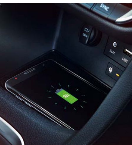
Wireless charging Qi 制式手機無線充電

i30 N 為你提供車廂內的無縫連接，於飛翔的旅程中有完善的娛樂系統伴隨，為你的快樂再添一絲喜悅。車廂內的娛樂設備支援IOS及Android，通過 Apple CarPlay或 Android Auto 將智能手機內容同步至車內8吋輕觸式顯示屏，實行汽車手機合一。加上車廂的無線充電板，讓你的車廂佈置更俐落，享受完無束縛的快感。