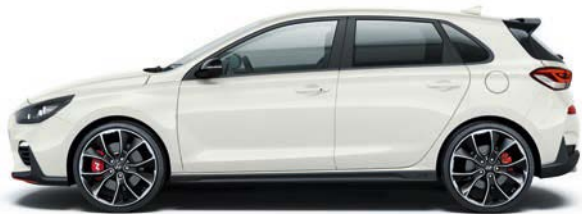
Polar White (Solid)