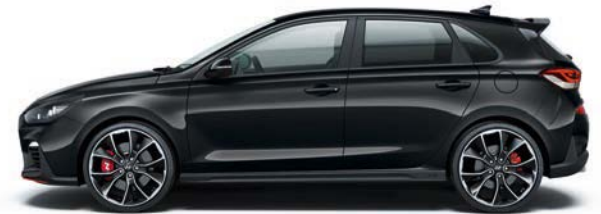
Phantom Black (Pearl)