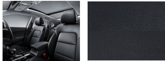
純黑調 Black pure tone (TRY)